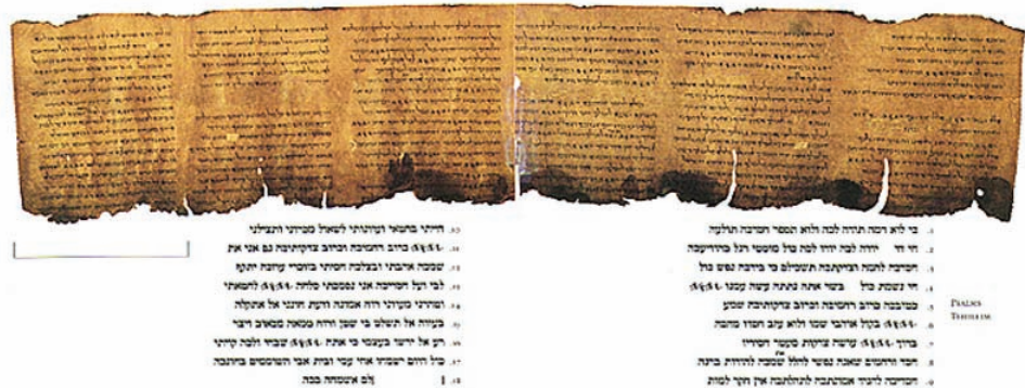
A portion of the Dead Sea Scrolls from Qumran Caves

These scrolls and writings - now known as the Dead Sea Scrolls - represented every book of the Old Testament except the Book of Esther, and are considered one of the greatest discoveries in modern times.